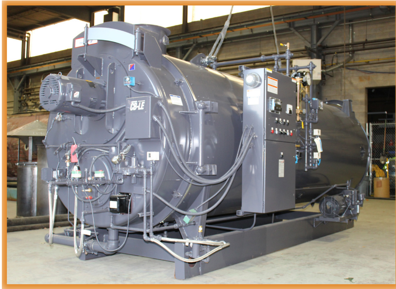
(SIMILAR BOILER PICTURED)