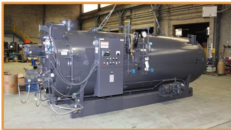
(SIMILAR BOILER PICTURED)